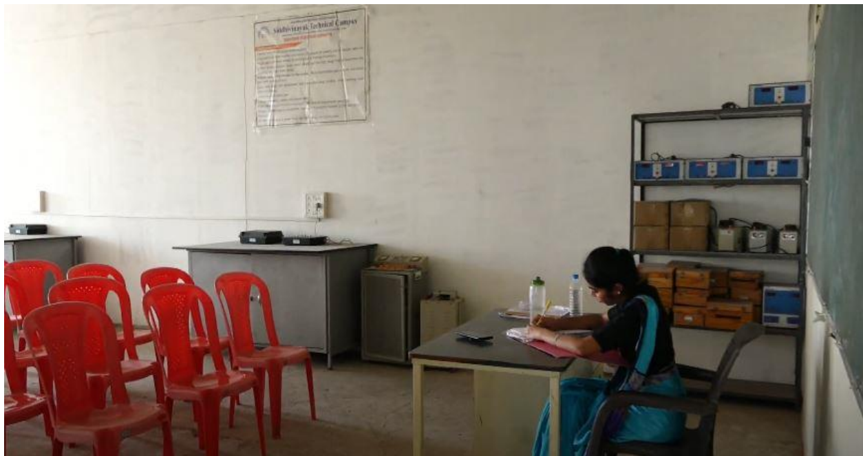
Room No: W1-4B