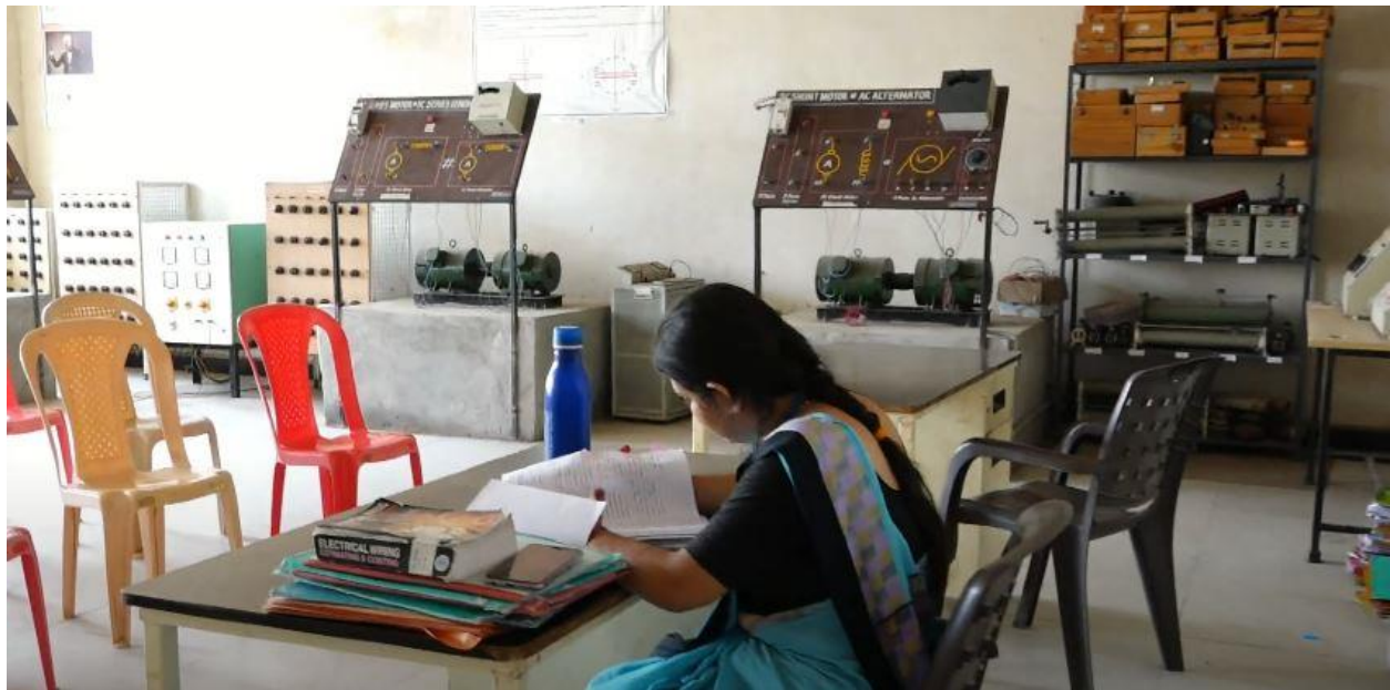
Room No: CG-05