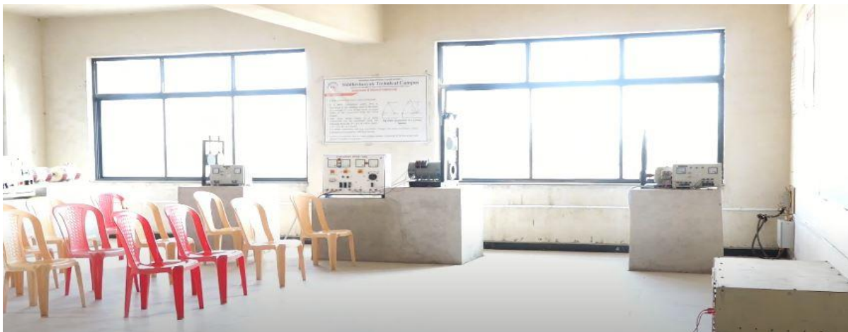
Room No: CG-04