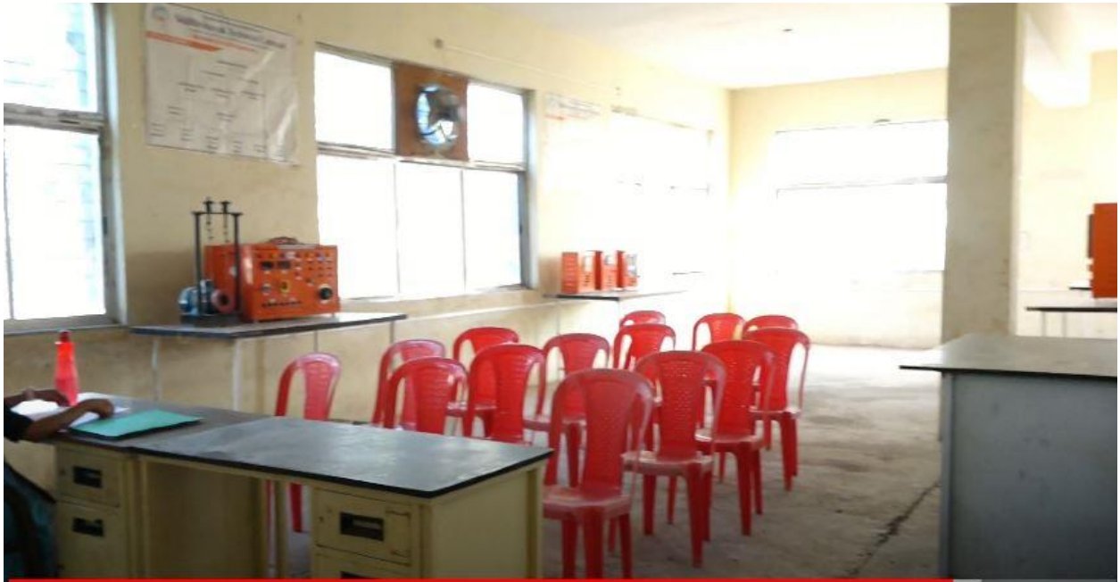
Room No: W1-4A