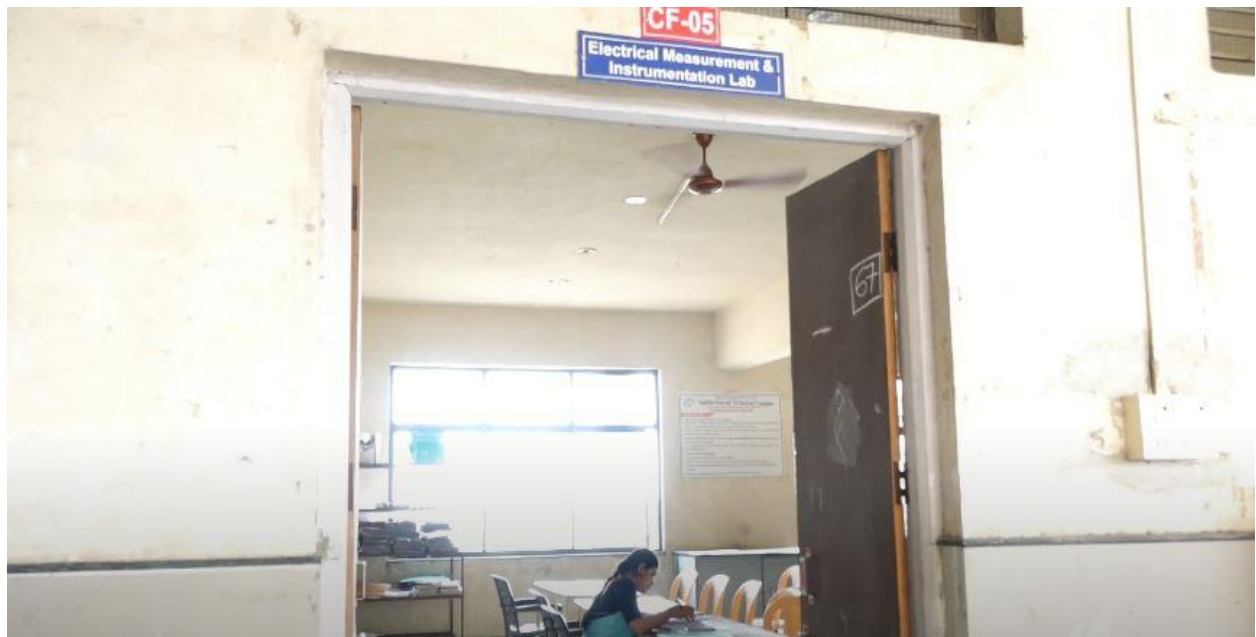
Room No: CF-05